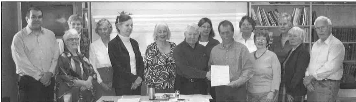
Some of the members of the Canadian Friends Historical Association are pictured with their motion to incorporate through affiliation with the OHS at a public meeting held at Pickering College, Newmarket.