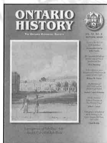
Autumn 2009 Ontario History Special Issue 1837-8 Rebellions