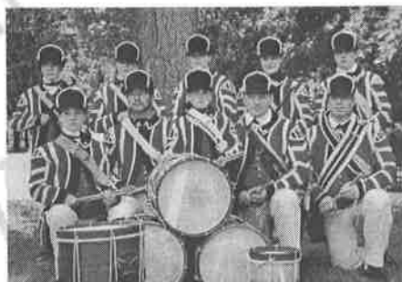
U.E.L. Loyalist Fifes and Drums celebrate the 50th Anniversary of the United Empire Loyalists Association, Bay of Quinte Branch, on June 17, 2006.

Heritage Centre & Park in Adolphustown. An official parade then led to the 1784 Loyalist Cemetery and after a service of dedication I laid a wreath on behalf of the OHS at the obelisk. Later in my speech, I referred to an