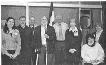
Accessibility workshop held in Ottawa, 2006.

The OHS continued its project, "Making Ontario's Heritage Accessible to People with Disabilities" (2004-2006) in partnership with the Accessibility Directorate of Ontario, Ministry of Community and Social Services. The OHS organized and implemented heritage accessibility workshops in Ottawa and Newmarket with the support of the Accessibility Directorate of Ontario. Our partners for these accessibility workshops were The Council of Heritage Organizations in Ottawa/ Conseil des organismes du patrimoine d'Ottawa (CHOO/COPO), The Library and Archives of Canada's Diversity and Employment Equity Committee, the York Durham Association of Museums and Archives, York Region Tourism and the York Region Accessibility Advisory Committee.