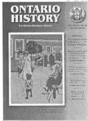
Fall 2006 Ontario History