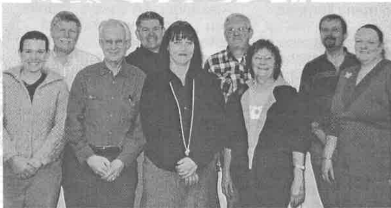
In 2006, the OHS welcomed new affiliate member from St. Catharines, The Friends of Diana Sweets.