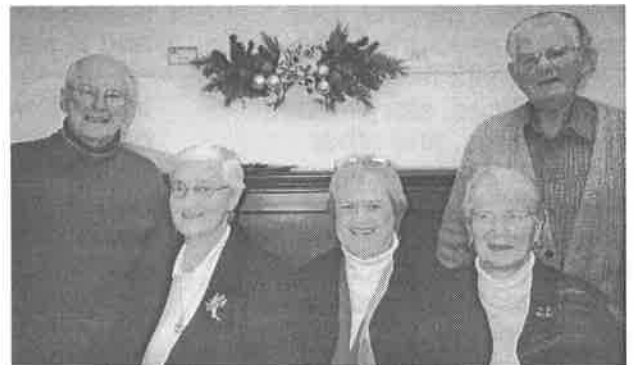
Welcome to new OHS member the Tillsonburg and District Historical Society (TDHS). Seen here at Annandale House, a National Historic Site, are some of the TDHS Board Members.