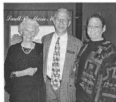
The Sault Ste. Marie Museum hosted a Gala Evening Sept. 28, 2006, to celebrate the 100th Anniversary of the "Old Post Office" building.

On September 28th, 2006, the Sault Ste. Marie (SSM) Museum hosted a Gala Evening to celebrate the 100th Anniversary of the "Old Post Office" building, a designated heritage site which houses the Museum. I was an invited guest of the evening and spoke on the important role non-government organizations play in preserving our local heritage and the invaluable contribution of volunteers. At