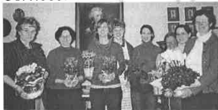
The Culinary Historians of Ontario are seen here at the annual Cookbook Caper at the John McKenzie House.

municipal heritage committees, accessibility consultants, pioneer villages, art galleries, cultural centres, regional consultants from the Ministry of Culture, Citizenship & Immigration and Tourism, municipal accessibility advisory committees and people with disabilities. The OHS has now submitted a final draft of the Accessibility Information and Resource Tool Kit to the Accessibility Directorate of Ontario for approval by the Ministry of Community and Social Services.