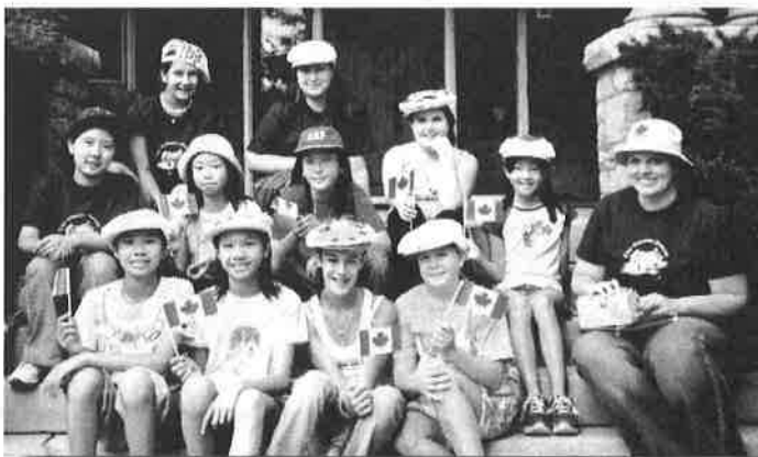
Pictured is one of the camp groups in front of the OHS headquarters where campers were greeted and presented with their treasure chest and Canadian flags.

The OHS again participated in the Gibson House Museum's Arts and Heritage Camp. Six different teams of summer campers had treasure hunts through Willowdale and ultimately found the treasure chest at the John McKenzie House.