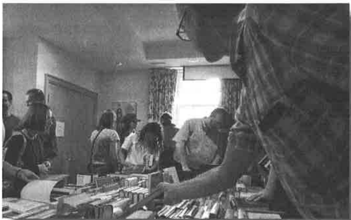
Many happy book hunters, including students, collectors, and dealers look over several thousand titles for sale at $3 each.

This program offered participating affiliated societies with a low-cost option for Directors & Officers coverage. 40 societies (approximately 14% of all affiliates) were needed to initiate the program. Information on this and the Society's comprehensive commercial liability insurance program, including application forms, were mailed out in late summer. Unfortunately, the program was cancelled later in the year due to lack of interest.